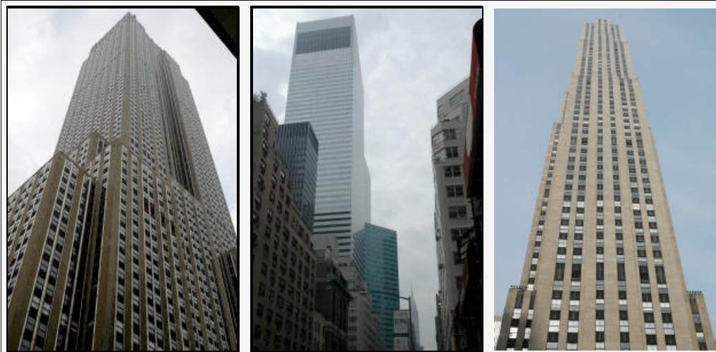
Three of Manhattan's impressive Skyscrapers!

After a splendid day, under the best weather conditions conceivable, we were thrilled to be among things like the Chrysler building, Trump Tower, Empire State Building & the Rockefeller building. We also saw the Jewish temple (impressive from the outside, spectacular on the inside!!), the New York Public Library, a short and unexpected visit to the sound check for the David Letterman program, Times Square, City Hall, the subway, Ground Zero, and Wall Street.